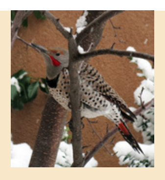
Northern Red-Shafted Flicker